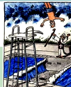
Moses' first and last day as a lifeguard.

We are exploring the Beatitudes, specifically, experiencing the blessing of being peacemakers