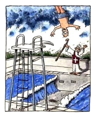
Moses' first and last day as a lifequard.

In light of this month's lesson, in case you missed it a few weeks a few weeks